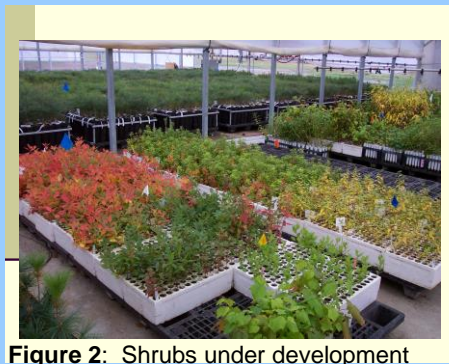
Figure 2: Shrubs under development at the USFS Coeur d'Alene Nursery for Western Federal Highway projects.