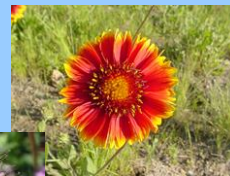
Figure 3. A variety of native plant materials is used which provides numerous benefits to National Forest System lands including nectar and pollen for pollinators.