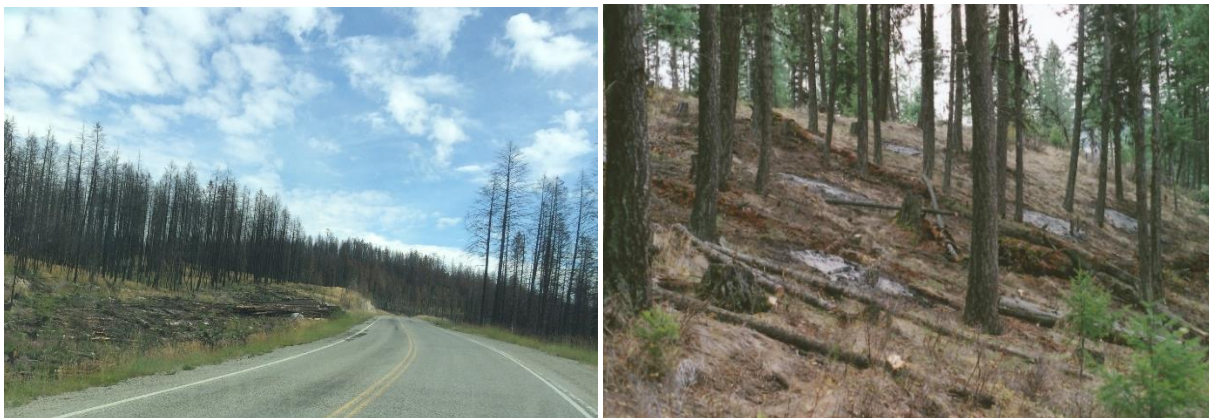
Figure 2 a) unmanaged forest with 100% mortality from wildfire and b) managed forest with jackpot burns to reduce fuel loads

Fire scientists who have studied the fire ecology of these systems for decades have long advocated for management action to mitigate fire risk and bring the forest condition into alignment with the fire ecology of the west (Agee and Skinner 2005, Skinner et al 2004). Fire impacts can be substantially reduced by thinning treatments that restore densities more like those observed before fire suppression was introduced. Multiple studies have shown that thinning reduces fire severity, sufficient for firefighters to gain control and maintain forest structure, tree seed source, and other values (e.g. Agee and Skinner 2005, Moghaddas 2006, Skinner et al. 2004). General principles of fire management based on long term research have been integrated into tools that can assess the impacts of fire and management for any combination of site, stand and climate conditions. These tools were used to model nine different forest management treatments on over 25,000 forest inventory plots in Arizona, California, Colorado, Idaho, Montana, New Mexico, Nevada, Oregon, Utah, Washington, and Wyoming. Results show that in most cases, managing forests created a more favorable forest carbon outcome (Figure 2b) than letting nature take its course (Figure 2a).