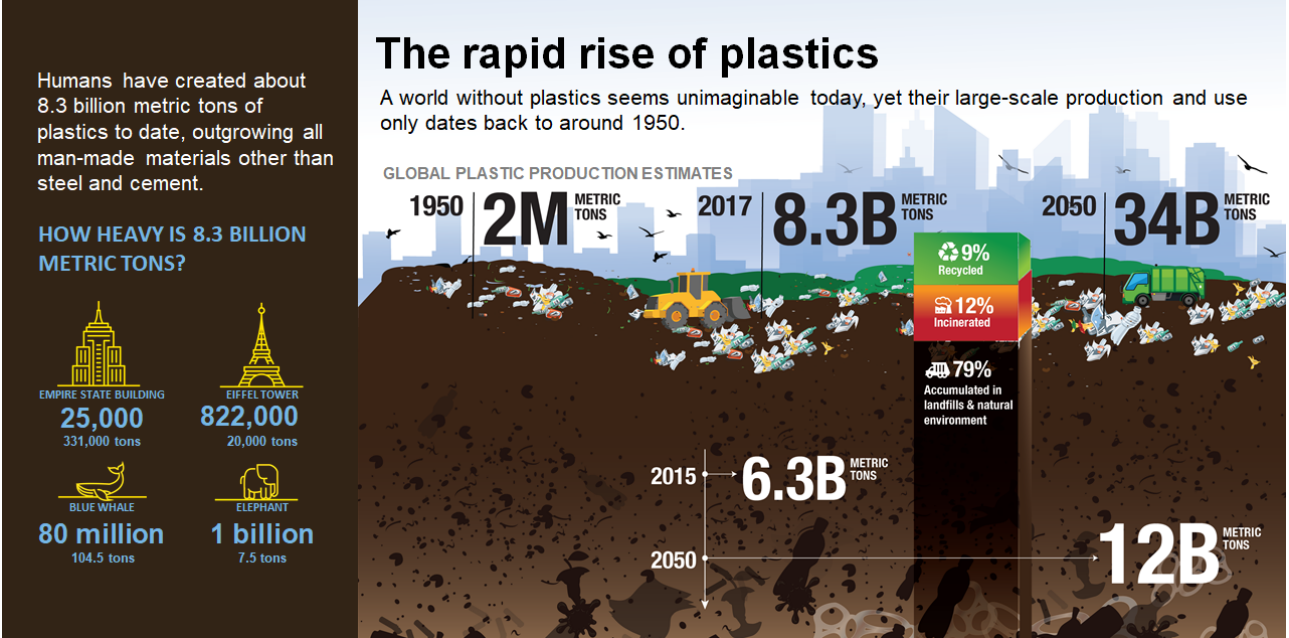
Figure 1. Global Materials Flow of Plastic<sup>6</sup>

production and 12 billion metric tons of waste, the management of plastic in the waste stream is only continuing to grow.<sup>6</sup>