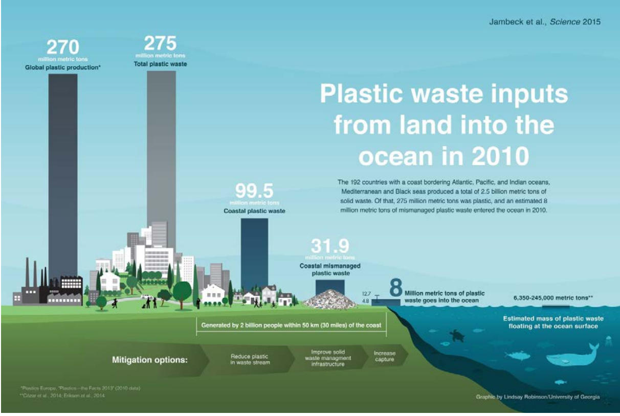
Figure 2. Plastic Waste Inputs from Land into the Ocean in 2010

The U.S. is one high income country on the list, and while our waste management systems are welldesigned and very effective, and the only mismanaged waste is from litter, we have a large coastal population and a large waste generation rate. If we look to the future, and assume a business as usual projection with growing populations, increasing plastic consumption and increased waste generation, but no increase in capture of waste, by 2025, the 8 million metric tons doubles – with a cumulative input by 2025 of 155 million metric tons.