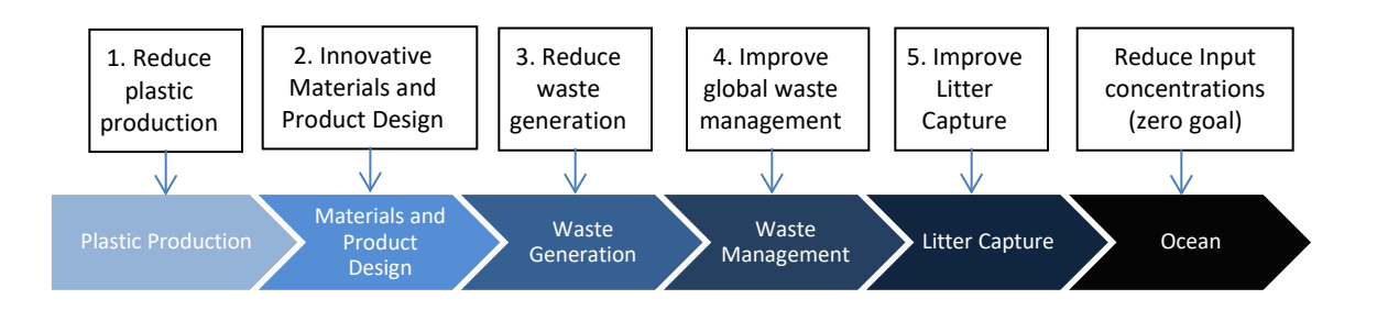
Figure 4. Intervention and Mitigation Strategies along some Points in the Plastic Value Chain

I developed the framework below for my 2016 testimony<sup>36</sup> and would like to submit it again with some ideas, further explanation and answers to some of the questions posed by the senators in this hearing. This framework provides intervention points (1 through 5) and then a list of potential (but not all encompassing) interventions that may occur at the various points. In general, this represents a hierarchy of interventions. However, the most "bang for your buck" interventions will depend on the needs of the specific geography addressing the issue, however, in many cases, all geographies have points along the entire framework that will help reduce debris and plastic going into the ocean. Some interventions can be immediate and some will take more time. The framework starts on the left with the most "upstream" interventions and ends with a last chance to capture the material before it enters the ocean. In many cases the interventions offer the opportunity for economic innovation and growth. The USA could be a leader in several of these categories of interventions.