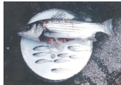
Small striped bass with eight juvenile salmon in stomach.

The issue of predation did not occur overnight and the research to show its effects has progressed over decades. For instance, in the San Joaquin Basin between 1986 and 2006, paired releases of large groups of marked young salmonids (smolts) were made near the upper extent of spawning and near the mouth of several tributaries of the San Joaquin River: the Stanislaus, Tuolumne, and Merced rivers. Survival of fish in these tributaries was estimated based on the numbers of tagged smolts from the upper group relative to the lower group that were later recovered in the San Joaquin River at Mossdale. These mark-recapture studies provided the first direct estimates of very poor tributary survival in some years.