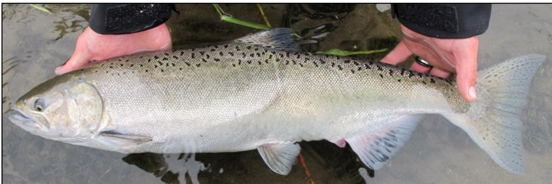
Adult Hatchery Chinook Salmon Captured in the Stanislaus River

Multiple fish hatcheries were constructed in California's Central Valley to mitigate for lost spawning habitat created by dams (Shasta, Folsom, Oroville, Camanche, and New Exchequer) built for both the Central Valley and State Water Projects. Over time, fall run Chinook salmon propagated at the five Central Valley hatcheries have comprised increasing proportions of the fishery, and best available estimates indicate that approximately 90% of the current commercial catch is composed of hatchery fish (Barnett-Johnson et al. 2007, Kormos et al. 2012, Palmer-Zwahlen and Kormos 2013, Palmer-Zwahlen and Kormos 2015). Clearly, without artificial supplementation, there would not be a commercial salmon fishery currently in the state.