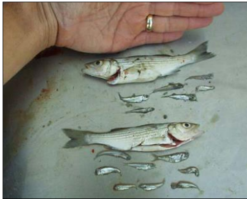
Juvenile salmon cut from the stomachs of juvenile striped bass demonstrate it's not just large fish that impact salmon populations.

Differences in catches between upstream and downstream rotary screw traps in the Tuolumne River between 2007 and 2012 also indicate high losses, ranging from 76% to 98%. In 2012, a study of rotary screw trap monitoring on the Tuolumne River documented 96% mortality of juvenile Chinook outmigrants between these two trapping stations. As part of the FERC relicensing of the Don Pedro Project, a predation study conducted later the same year found that, based on observed predation rates and the estimated predator abundance between the traps, it is plausible that most of the losses of juvenile Chinook salmon between the two traps could be attributed to predation by non-native predatory species. A second year of more comprehensive investigation of predation in the Tuolumne River was planned for 2014 following on the heels of this ground-breaking work completed in 2012; however, permits have not been issued by CDFW.