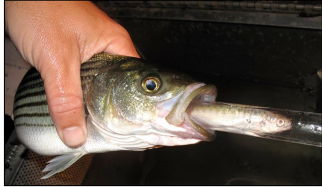
Recently eaten juvenile Chinook salmon pumped from the stomach of a striped bass in the Tuolumne River. 2012.