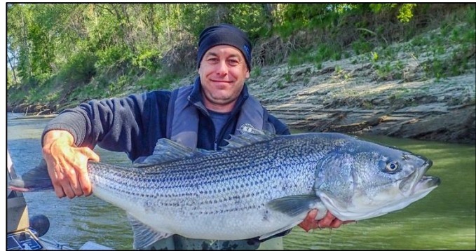
FISHBIO researcher with a Striped Bass, Sacramento River, CA

California resource agencies sink tens of millions of dollars every year into a failing effort to protect native and endangered fish species, while also bolstering introduced top-level predators that are decimating the very fish they are required to maintain. Without question, California's capital and time investments rival other successful fish recovery programs exemplified in the Pacific Northwest and Columbia River, but long-standing conflicting statutes and policies create fatal flaws that hinder native fish recovery. Decades of research, declining populations, and confused policies show that management of California fisheries is painfully ineffective. Resource agencies have acknowledged, but not addressed the problems.